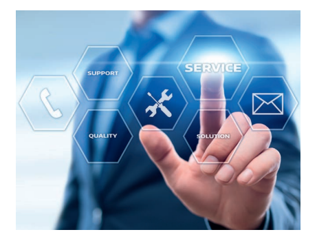
Remote technical support with Easy Check All sterilisers of the SW Plus range are equipped with incorporated Wi-Fi and Ethernet port. Connected to the Internet by enabling the Easy Check service, they can receive remote support. Intervention times can be significantly reduced thereby allowing technicians to keep machines constantly efficient.

Traceability software MyTrace is the traceability software available for SW Plus. By using this programme, each set of sterilised instruments can be associated to the patient through a bar code. This essential software completes the sterilisation process and provides legal protection to dentists.